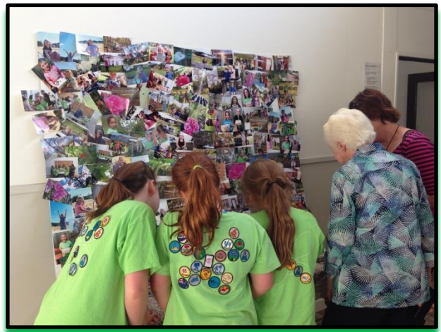
"Here's me grandma!"